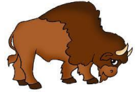
2014 Fun Emblems