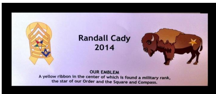
Associate Patron's Emblems