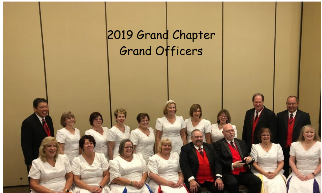
2019 Grand Chapter Grand Officers