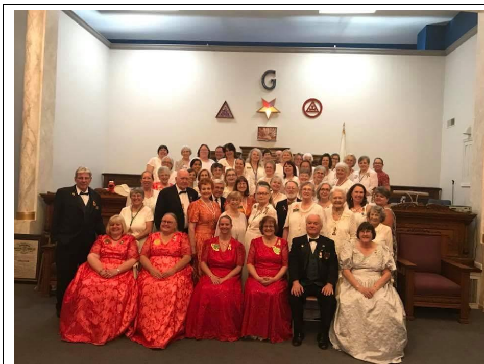
Official Visit of the Worthy Grand Matron and Worthy Grand Patron