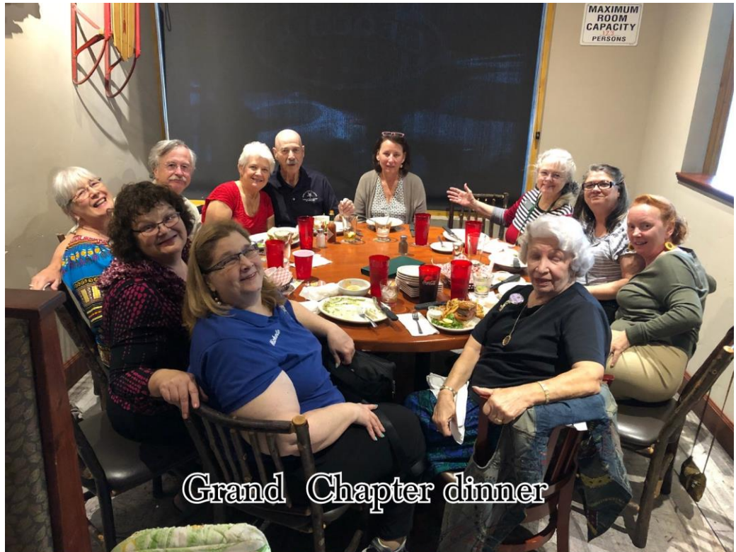
Grand Chapter dinner